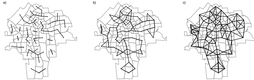
Figure 3: (a) k = 1 neighbours; (b) k = 2 neighbours; (c) k = 4 neighbours

representation of the spatial weights can become block-diagonal if observations are appropriately sorted.